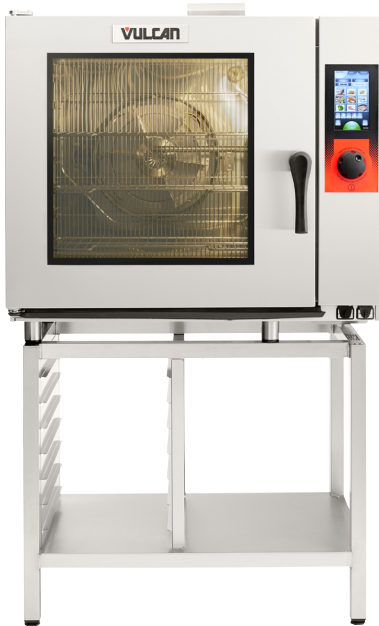
Model TCM61E Shown on optional stand